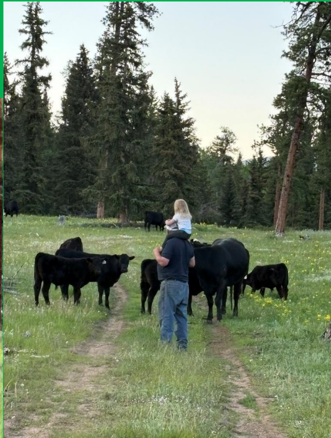
The next generation of calves and ranchers

Summer is my personal favorite season. The days are long and warm and the wildflowers are abundant. We have been so blessed to have amazing grass, water and the cattle are doing great!